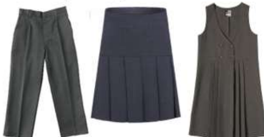
Trousers, skirt or pinafore dress