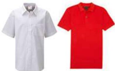
White shirt or red polo shirt