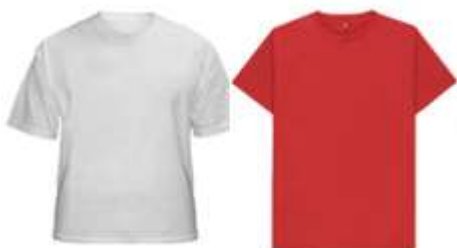
White or red plain t-shirt