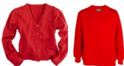
Red cardigan or jumper